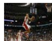
Raptors beat Nets 109-91