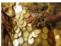
Golden dress studded with gold coins