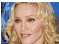
Madonna presents directorial debut