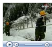
Reconstruction becomes top priority after snow disaster