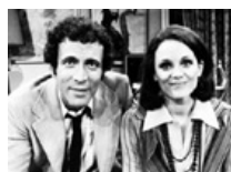
"Rhoda" actor David Groh dies at 68