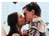
DiCaprio's Romeo and Juliet tops movie tear-jerkers list