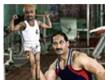
World smallest bodybuilder at 84 cm tall, 9 kg weight