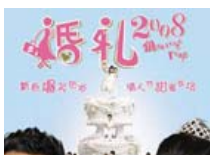
"Marriage Trap" visible on Valentine's Day