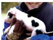
Pig "Valentine" for Valentine Day