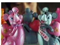
Cute mice couple made with eco-friendly materials